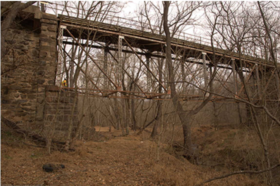
Figure B9. Bedford County Structure No. 6087

Current Historic Structures Task Group Observations and Recommendations: The current inspection report indicates that this structure is in poor condition. Previous repairs are in accordance with Recommendation 1 in the 2001 Management Plan. The task group defers further recommendations pending the results of the consultant’s evaluation.