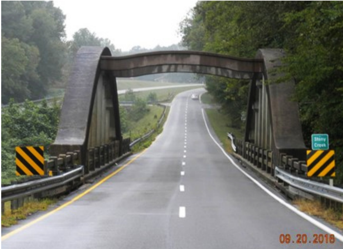
Figure B27. Another View of Dinwiddie County Structure No. 1005, Showing the Repaired Portals