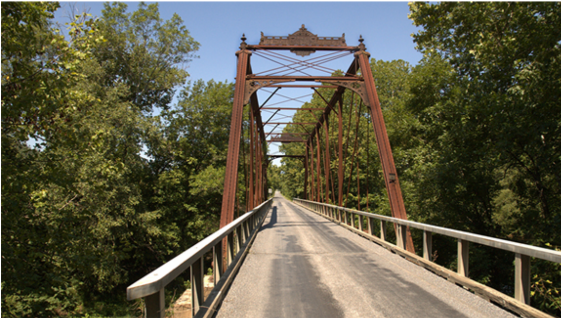
Figure B11. Botetourt County Structure No. 6386

Current Historic Structures Task Group Observations and Recommendations: The current inspection report indicates that this structure is in poor condition. Previous repairs are in accordance with Recommendation 1 in the 2001 Management Plan. A rehabilitation of this structure is planned. The task group concurs with this plan.