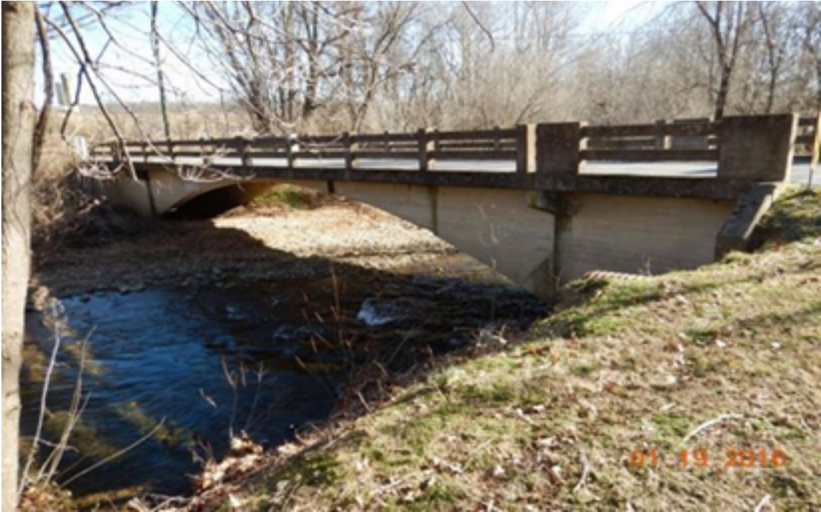
Figure B28. Augusta County Structure No. 6165

Current Historic Structures Task Group Observations and Recommendations: The current inspection report indicates that this structure is in fair condition. The task group reiterates the recommendations of (continued) repair and maintain for vehicular use, with subsequent preventive maintenance as needed, in the 2001 Management Plan.