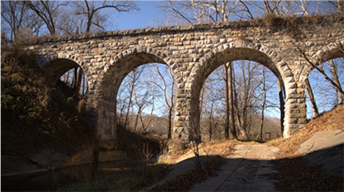
Figure B29. Augusta County Structure No. 6997 (Valley Railroad Bridge)

bridge office's assessment of drainage and masonry repair issues for this structure. However, the task group notes their strong support for maintaining this structure in good condition.