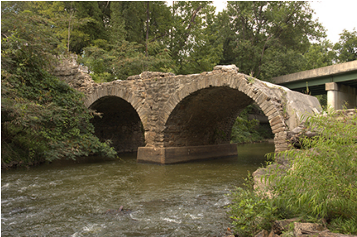
Figure B25. Falling Creek Bridge, Chesterfield County

Current Historic Structures Task Group Observations and Recommendations: The task group recommends preserving the remains of the old bridge as a ruin, with further stabilization as needed. If a crossing over Falling Creek is needed within the wayside, a modern pedestrian footbridge could be erected. Possibly this could use the old bridge as partial support. Interpretive signage to relate the history of the 1823 bridge is an additional recommended option.