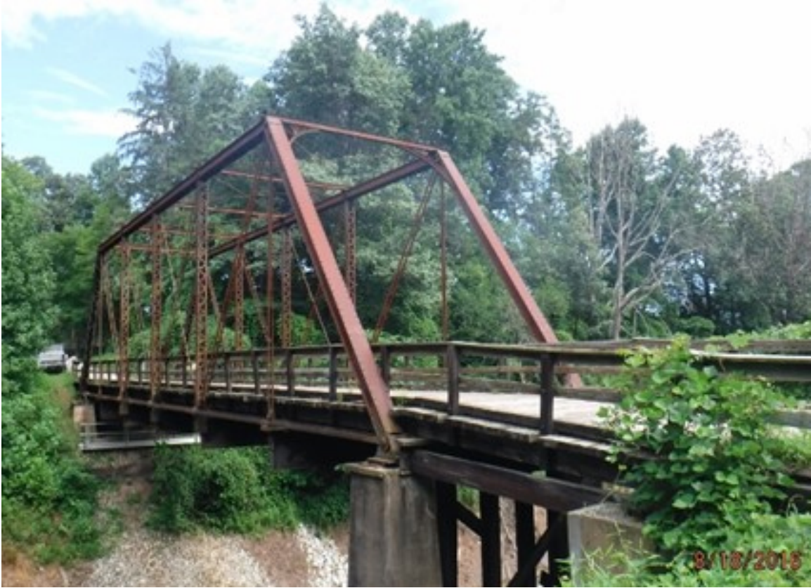
Figure B13. Nelson County Structure No. 6052