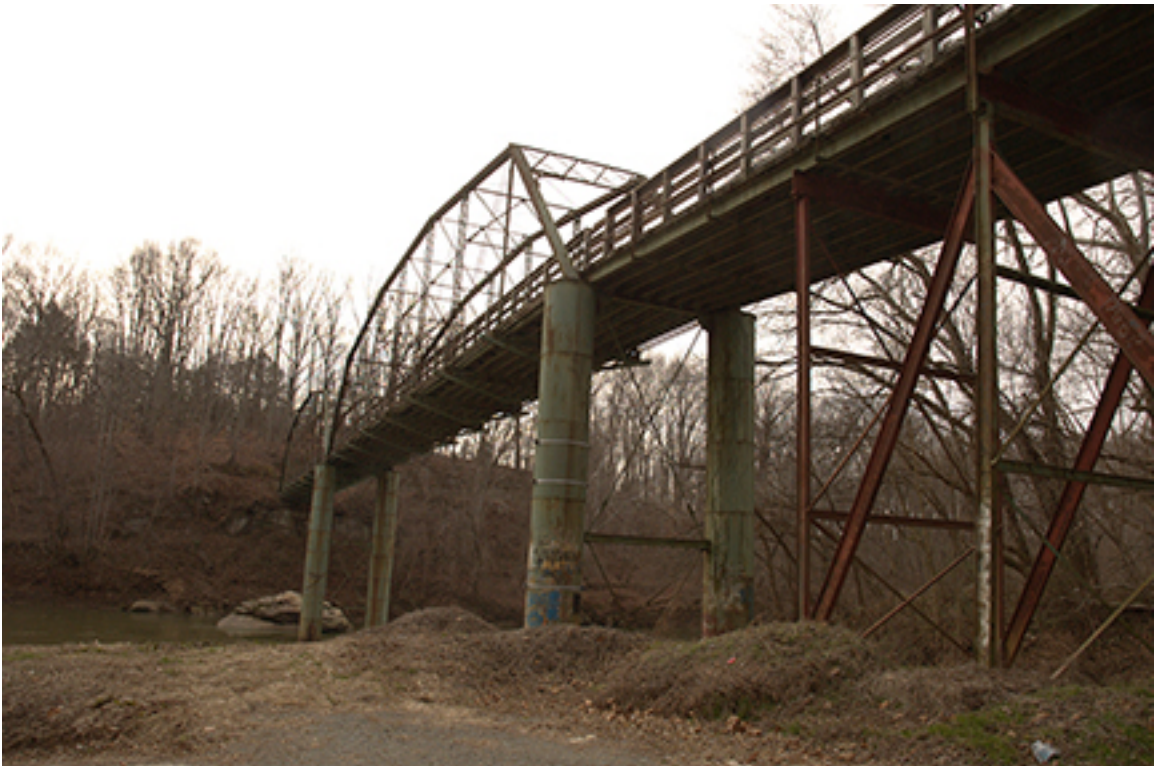
Figure B37. Charlotte County Structure No. 6902, Showing Lally Columns