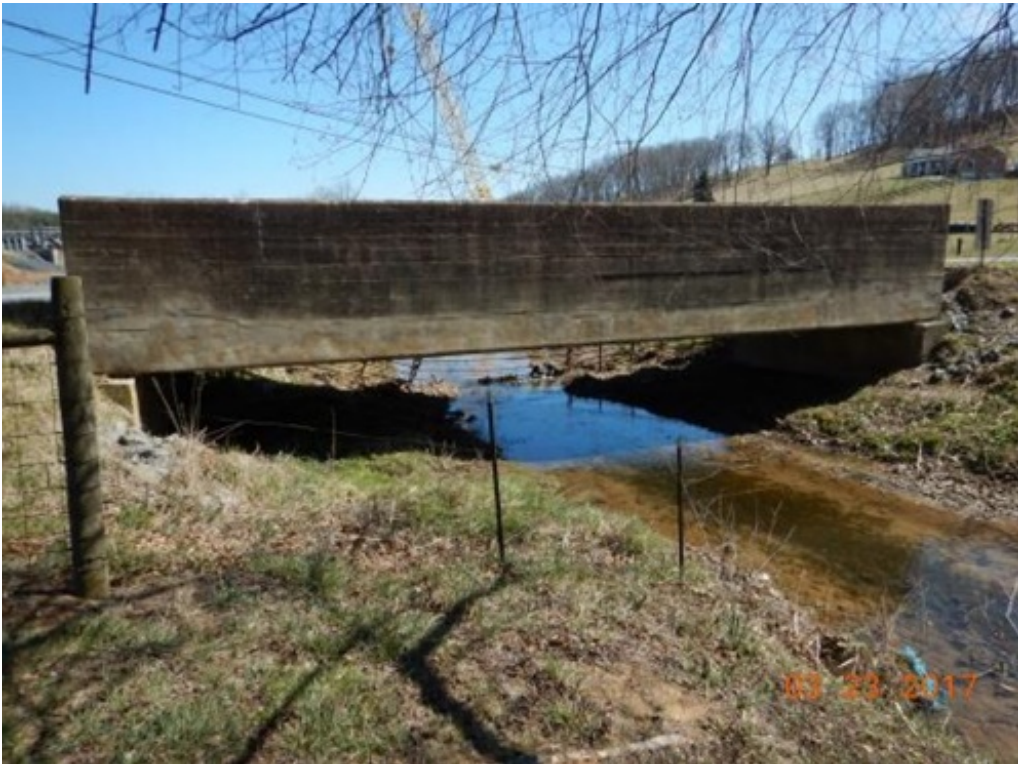
Figure B4. Another View of Augusta County Structure No. 6113, Showing the Typical Heavy Parapets of an Early Through-Girder Concrete Bridge