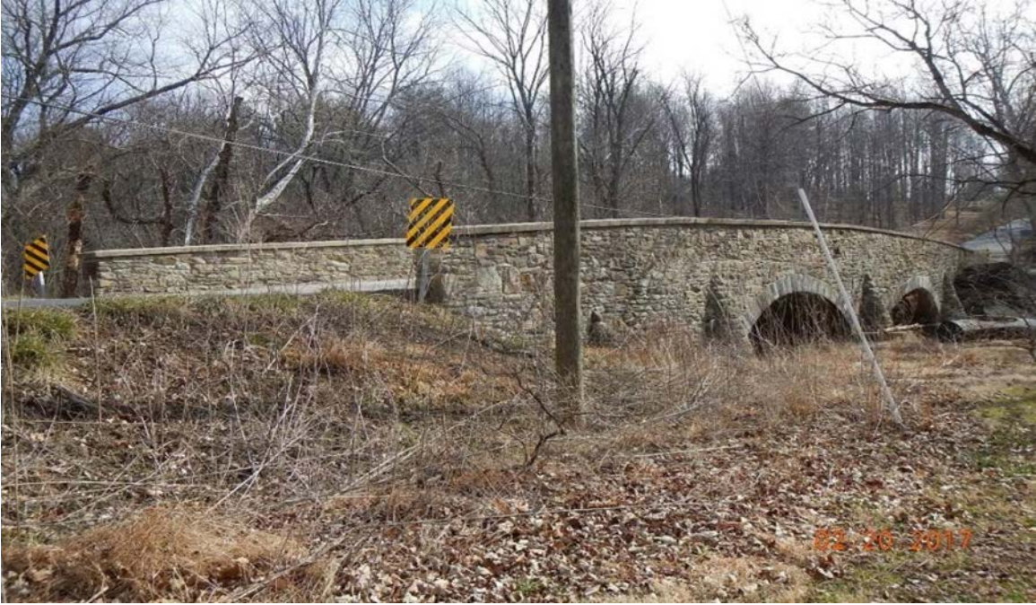
Figure B33. Loudoun County Structure No. 6088