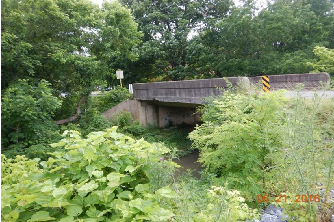
Figure B5. Augusta County Structure No. 6553