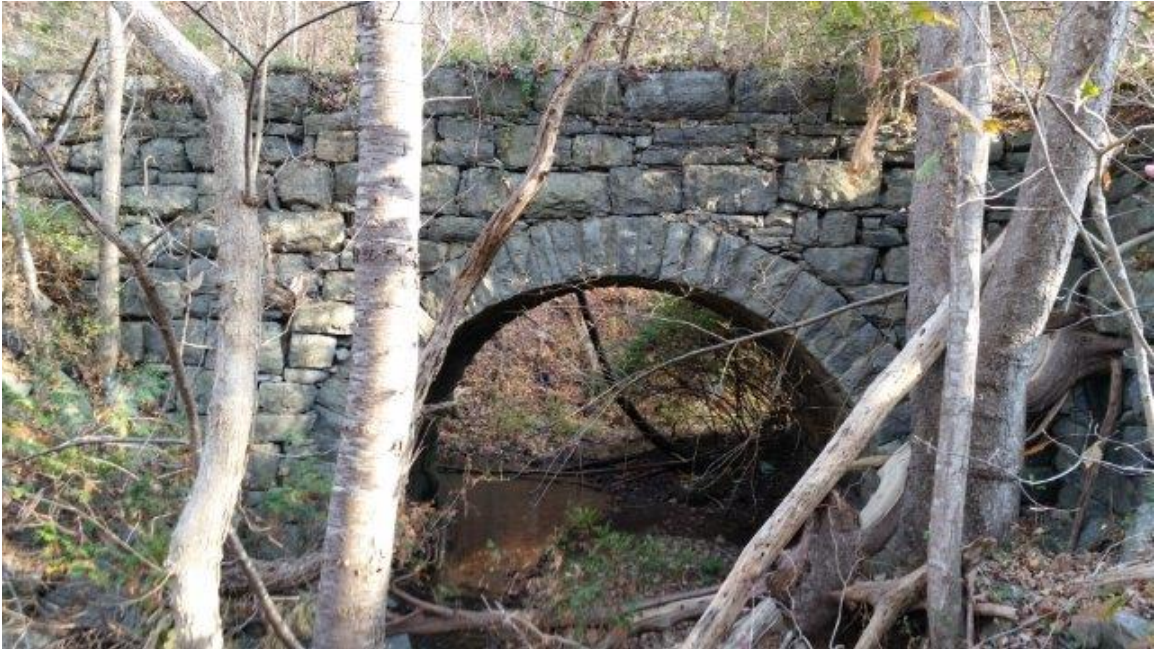
Figure B23. Southwest Turnpike Company Bridge, Wythe County

Current Historic Structures Task Group Observations and Recommendations: The task group reiterates the recommendations of repair and maintain for adaptive use, with subsequent preventive maintenance as needed, in the 2001 Management Plan.