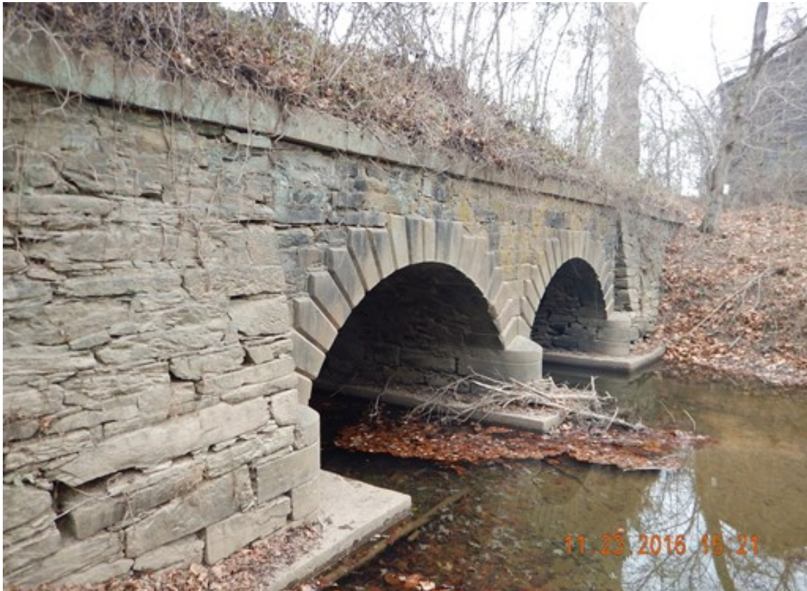
Figure B24. Nelson County Structure No. 6070

Current Historic Structures Task Group Observations and Recommendations: The current inspection report indicates that this structure is in fair condition. Previous repairs are in accordance with the Recommended Treatment in the 2001 Management Plan. The task group reiterates the recommendations of (continued) repair and maintain for vehicular use, with subsequent preventive maintenance as needed, in the 2001 Management Plan.