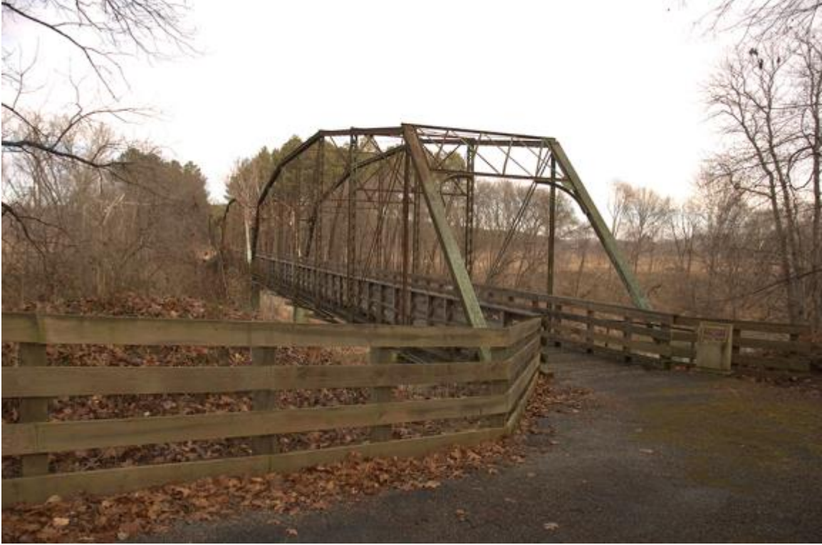
Figure B36. Charlotte County Structure No. 6902