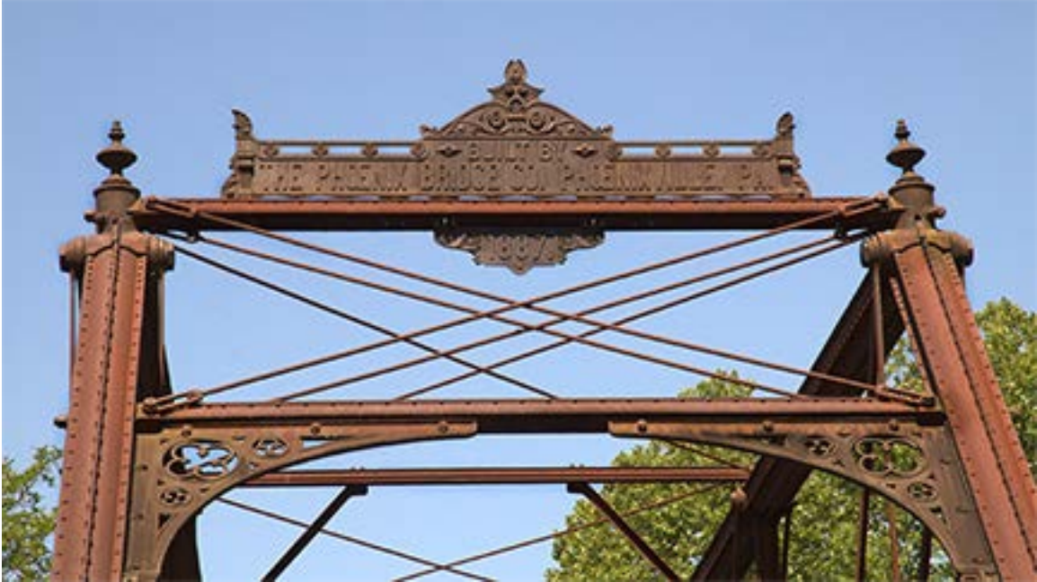
Figure B12. Botetourt County Structure No. 6386: Showing Details of Phoenix Columns and of Iron Decorative Elements