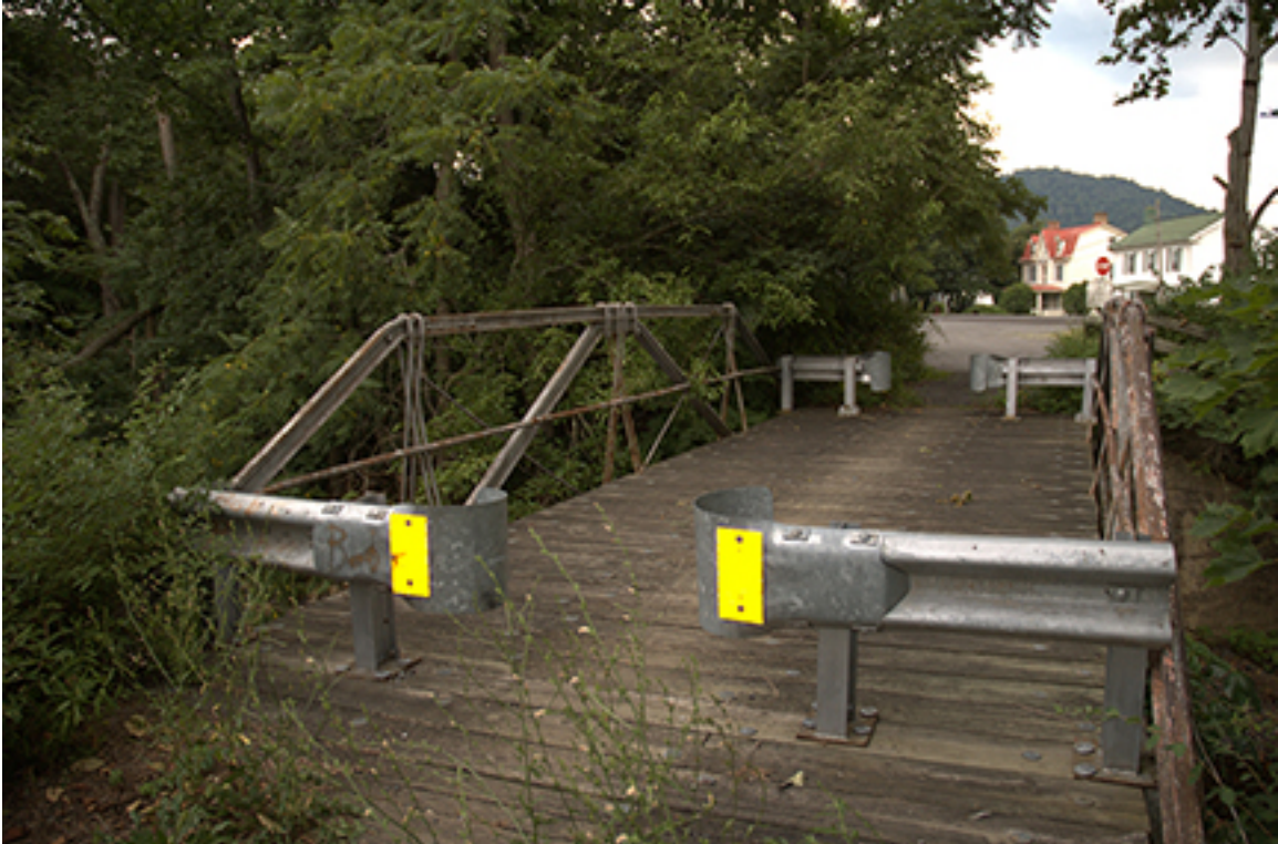
Figure B19. Highland County Structure No. 6034

trusses are rare: only four are known to be extant. If the county is willing to coordinate with VDOT for a transportation enhancement grant. VDOT could assist the county with the submittal and administration of such a grant.