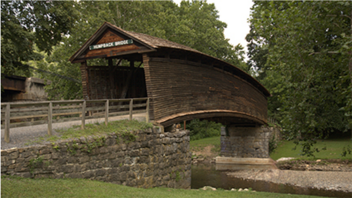
Figure B34. Alleghany County Structure No. 9007 (Humpback Bridge)

Management Plan. The feasibility of stream restoration techniques should be explored: these would keep the channel from migrating in normal flow. (The channel is fairly stable at present.)