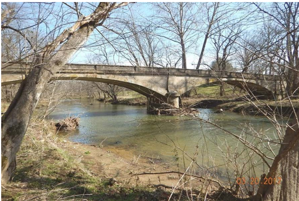
Figure B30. Frederick County Structure No. 6903

Current Historic Structures Task Group Observations and Recommendations: The current inspection report indicates that this structure is in fair condition. Previous and planned repairs are in accordance with Recommendation 1 in the 2001 Management Plan. Excluding the recommendation to pursue a transportation enhancement grant, the task group reiterates the recommendations of (continued) repair and maintain for vehicular use, with subsequent preventive maintenance as needed, in the 2001 Management Plan. The task group strongly recommends and supports the rehabilitation of this structure.