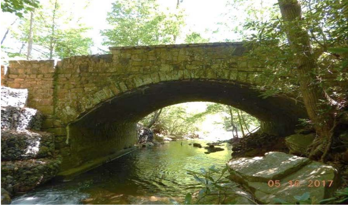
Figure B31. Rockbridge County Structure No. 1012