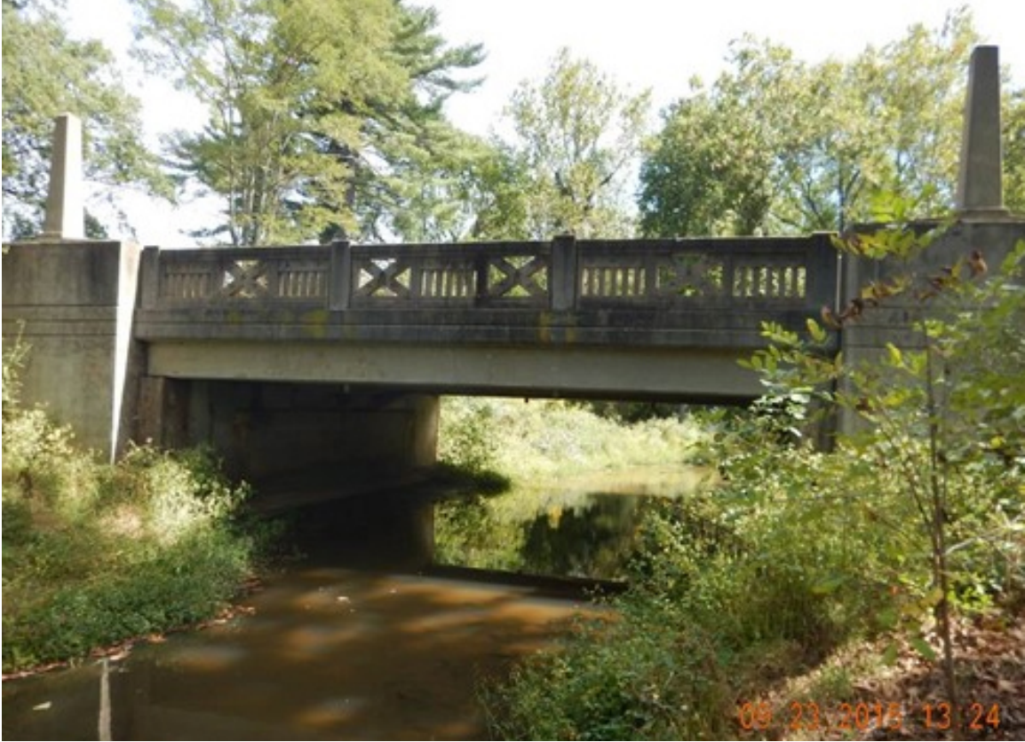
Figure B1. Appomattox County Structure No. 1002