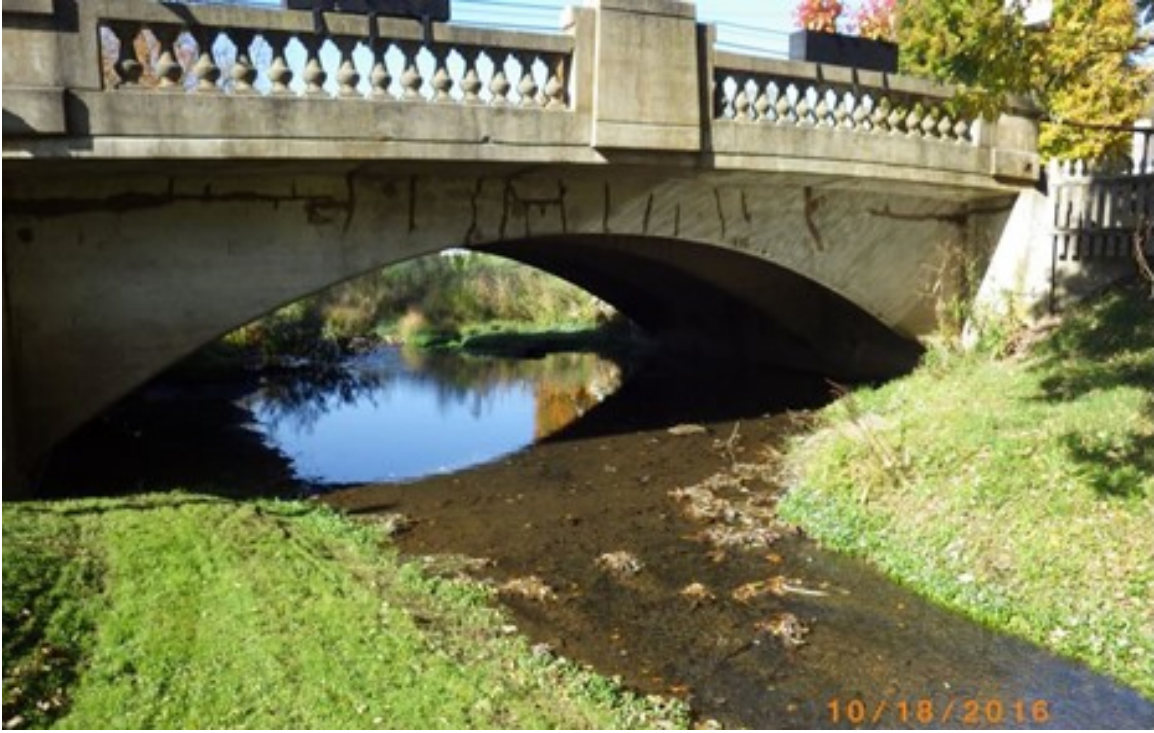
Figure B22. Bland County Structure No. 1021