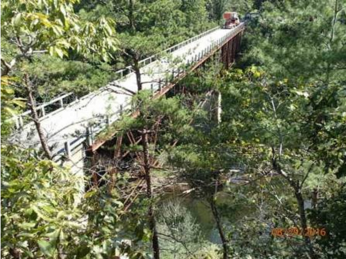
Figure B10. Botetourt County Structure No. 6100