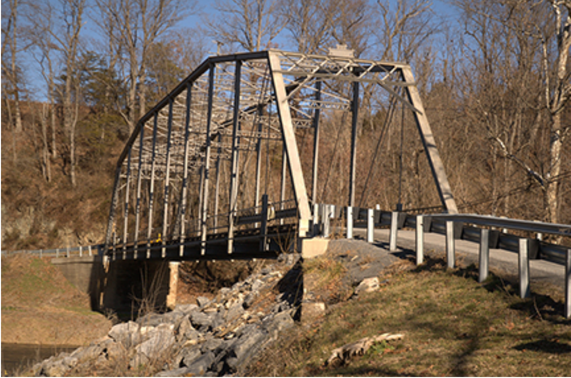
Figure B18. Augusta County Structure No. 6149