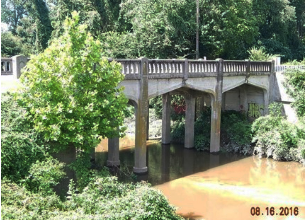
Figure B2. Henrico County Structure No. 1001