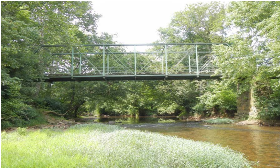
Figure B38. Culpeper County Structure No. 6906

Current Historic Structures Task Group Observations and Recommendations: This structure was not considered for task group recommendations in the current management plan update because of Section 106 review.