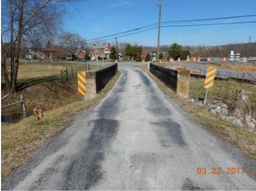
Figure B3. Augusta County Structure No. 6113: End View