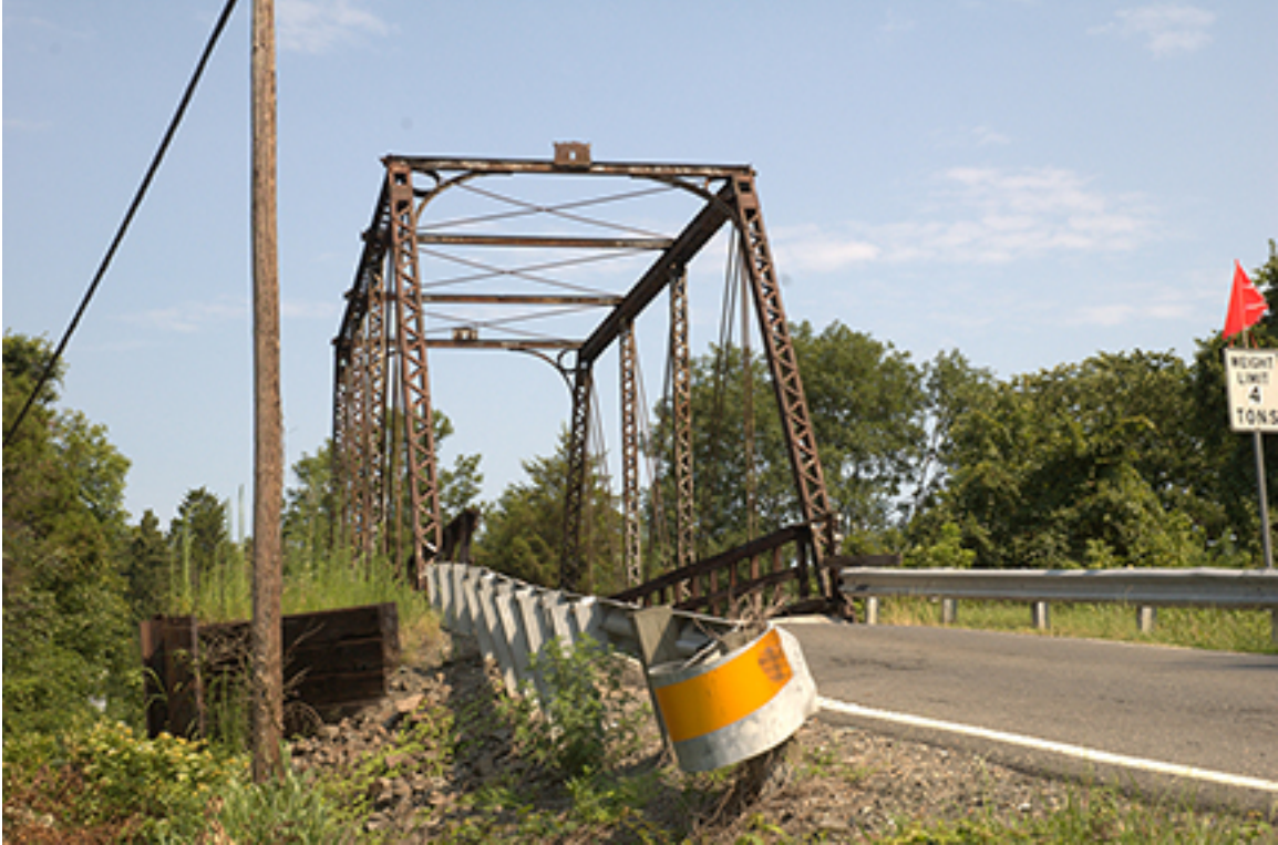
Figure B40. Prince William County Structure No. 6023 (Shown Prior to Disassembly)