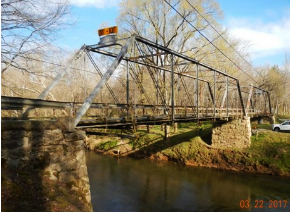
Figure B14. Brunswick County Structure No. 6104