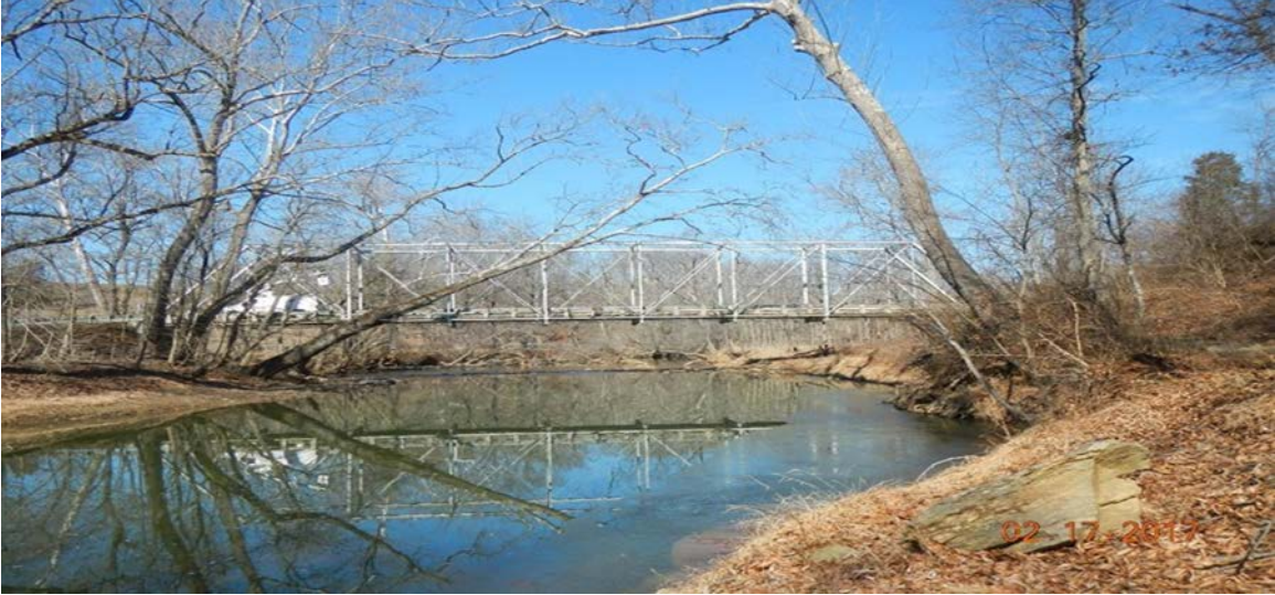
Figure B39. Loudoun County Structure No. 6051