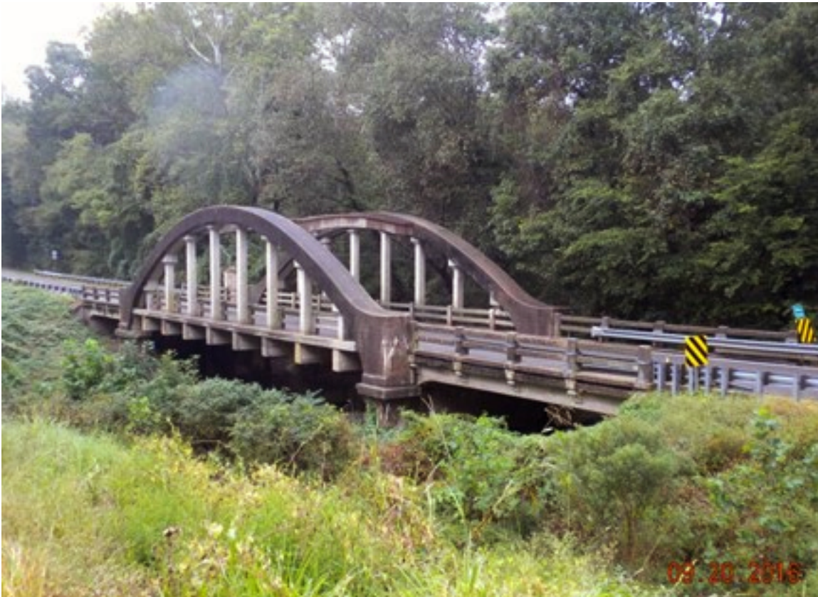
Figure B26. Dinwiddie County Structure No. 1005

Current Historic Structures Task Group Observations and Recommendations: The current inspection report indicates that this structure is in fair condition. Previous and planned repairs are in accordance with Recommendation 1 in the 2001 Management Plan. The task group reiterates the recommendations of (continued) repair and maintain for vehicular use, with subsequent preventive maintenance as needed, in the 2001 Management Plan.