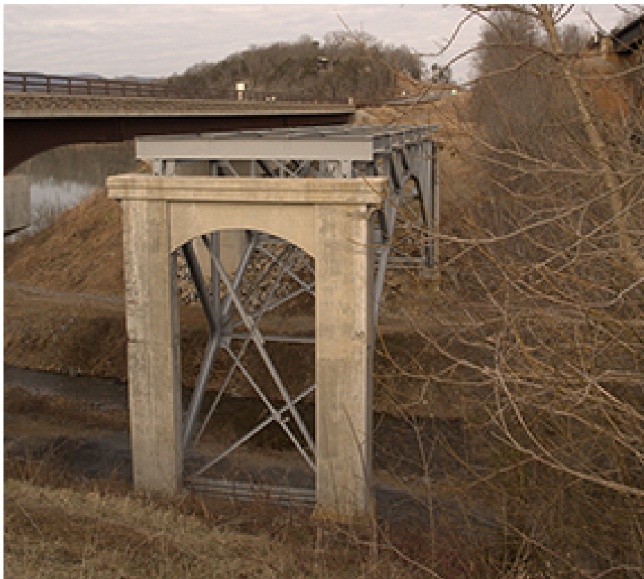
Figure B20. Page County Structure No. 9001 (formerly No. 1990)

Current Historic Structures Task Group Observations and Recommendations: Currently, the terms of the original and amended memoranda of agreement are being followed. Along with its use as a landscape feature and an historical exhibit, the bridge is serving an additional purpose in paint system evaluation. The task group supports the fulfillment of the memoranda of agreement and the continued use of the structure for paint system evaluation.