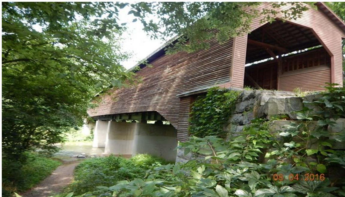
Figure B35. Shenandoah County Structure No. 6078

Current Historic Structures Task Group Observations and Recommendations: The current inspection report indicates that this structure is in good condition. Overweight and over-height and/or over-width vehicles must be prevented from accessing this bridge. Posted weight and height/width limitation signs have been repeatedly disregarded by drivers. The district structure and bridge office reports that physical limitations such as height-limiting bars (“bang” or “headache” bars) were previously considered and rejected because of potential liability concerns. But this issue is being revisited given the repeated damage to the bridge. Through traffic on the road has been restricted. The task group supports assessing all warning and signage opportunities to ensure signage in all directions. Sensors with audible alarms to detect over-height vehicles are also potential treatment options. There are several locations approaching the bridge from either direction that would support sensors with audible alarms and turn-arounds for over-height vehicles. The task group reiterates the recommendation of (continued) repair and maintain for vehicular use, with subsequent preventive maintenance as needed, in the 2001 Management Plan. As a second option, adaptive use (Recommendation 2 in the 2001 Management Plan) could be considered by the district structure and bridge office.