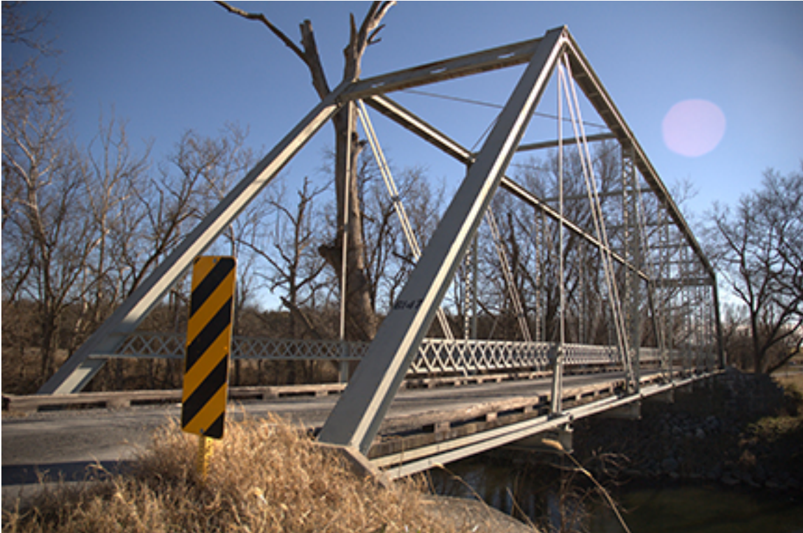
Figure B17. Augusta County Structure No. 6147

defers further recommendations pending the results of the district structure and bridge office's evaluation of this structure. However, the task group notes that (1) the crossing should be evaluated for its potential for non-vehicular use or (2) if necessary, the old abutments could be evaluated for the potential to support a new truss.