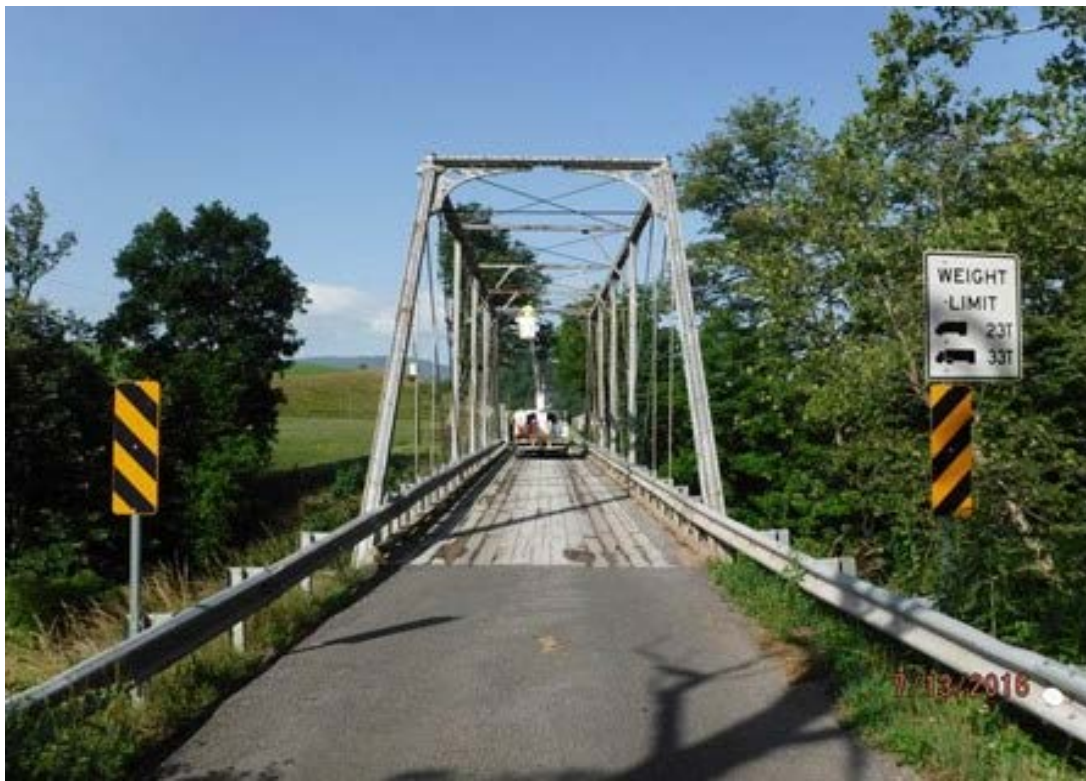
Figure B8. Another View of Wythe County Structure No. 6016, Showing Decorative Elements on the Portal. See Botetourt County Structure No. 6386 for a similar, but more highly ornamented, bridge.