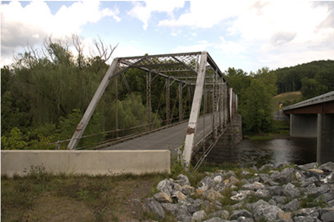
Figure B15. Alleghany County Structure No. 9008 (formerly No. 6064)

Current Historic Structures Task Group Observations and Recommendations: The current inspection report indicates that this structure is in poor condition. Currently, the 2009 agreement is being followed. The task group defers further recommendations at this time.