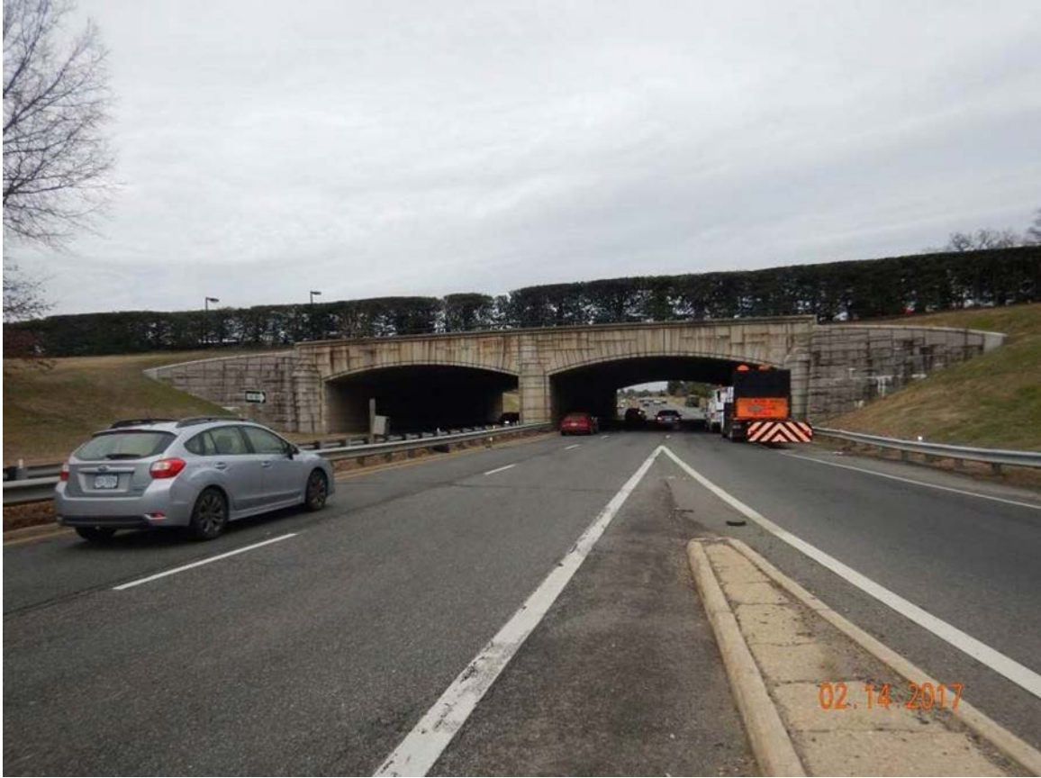
Figure B6. Arlington County Structure No. 5020