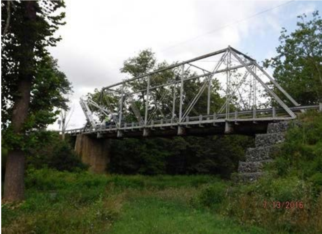
Figure B7. Wythe County Structure No. 6016