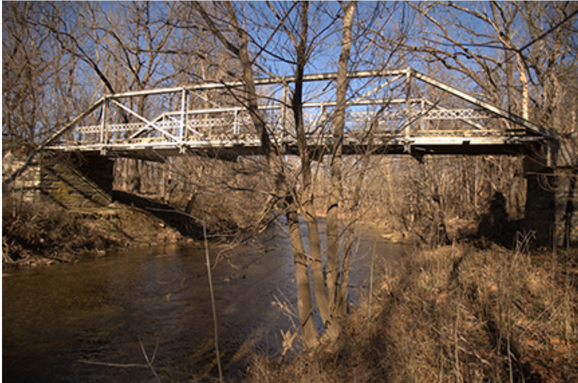
Figure B16. Augusta County Structure No. 6027

recommendations of (continued) repair and maintain for vehicular use, with subsequent preventive maintenance as needed (Recommendation 1), in the 2001 Management Plan, with Recommendation 2 (repair and maintain for adaptive use and transfer ownership on-site if a suitable recipient can be identified) as a possible second option.