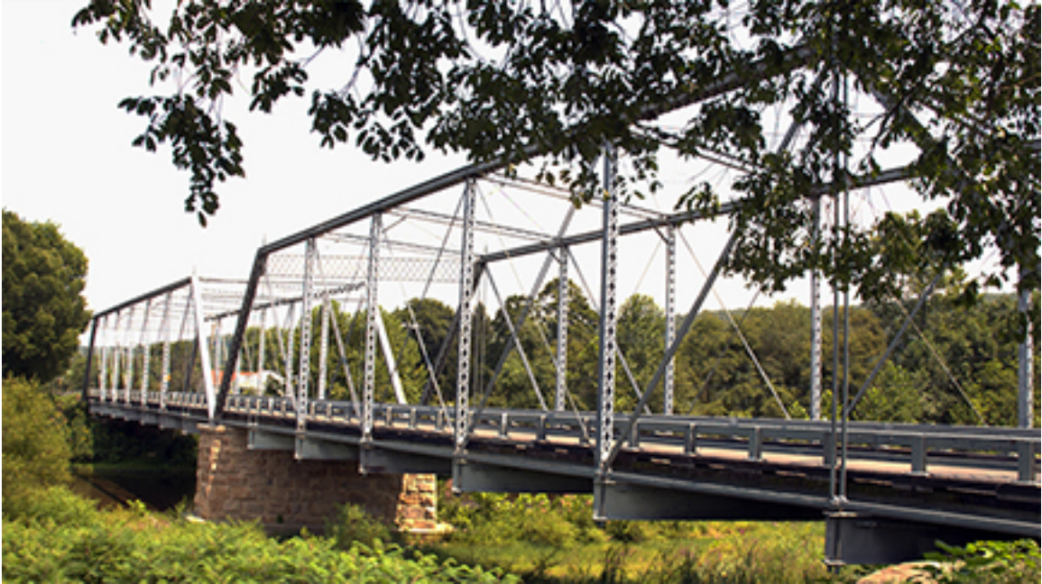
Figure B21. Rockbridge County Structure No. 6145