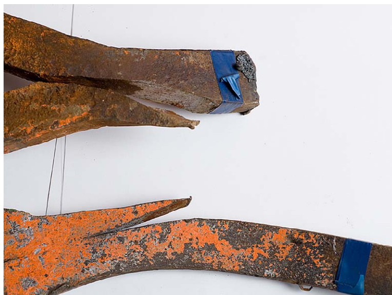
Figure 11. Eyebars Damaged by Grading Equipment