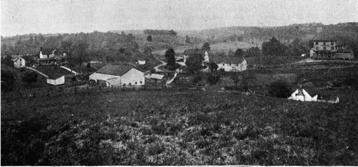
Figure 4. Advance Mills Village in Early 20th Century. The early bridge that crossed the river on a different alignment than the present bridge is visible between the white buildings in the center of the photograph (from The Daily Progress Historical and Industrial Magazine: Charlottesville, Virginia “The Athens of the South,” Progress Publishing Company, Charlottesville, Virginia, June 1906).

Subsequently, a one-lane metal truss bridge consisting of a short approach span (less than 20 ft long; probably a steel beam span), a main span (120 ft long), and a smaller pony truss span (65 ft long) was erected at the site of the present highway crossing.