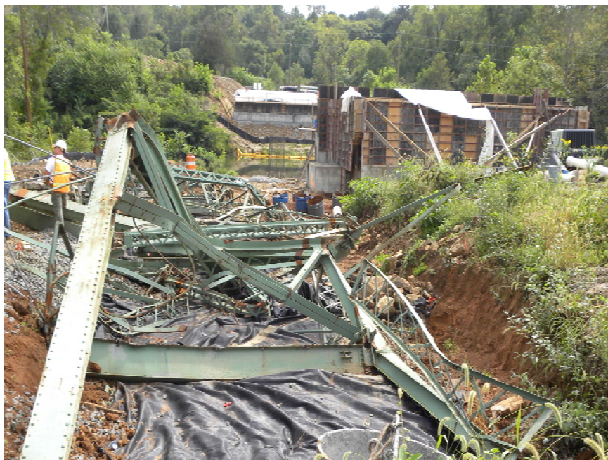
Figure 9. Total Collapse of Truss Because of Inadequate Support During Dismantling

Dismantling of the trusses began while no personnel from VDOT or VCTIR were onsite. Contractor personnel decided to dismantle the trusses one-half at a time, cutting the center upper chords first, without supporting the truss at its panel points. The result (Figure 9) was the total collapse of the bridge and the bending of most of the bars above the bottom chords. Panel points