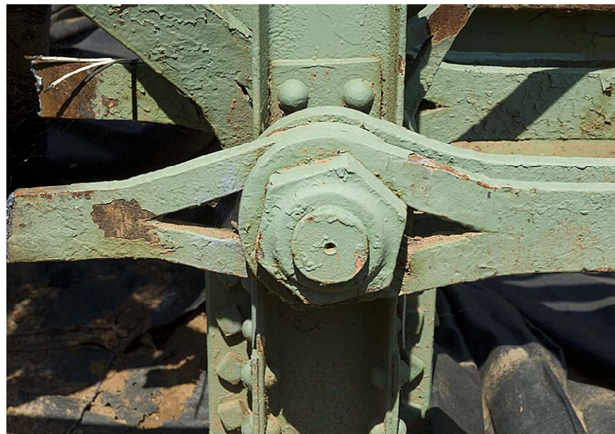
Figure 2. Pin-Connected Panel Point With Loop-Welded Eyebars

Failure of loop-welded bars at the forge line has been noted frequently during inspections of older truss bridges, and the use of loop-welded bars has long been prohibited by more modern specifications. Further, Ketchum (1912) recommended that only iron, not steel, be used for loop-welded eyebars: “Iron bars, both square and round, are often made with loop ends. Steel bars should never be used with loop ends for the reason that welded steel is not ordinarily considered