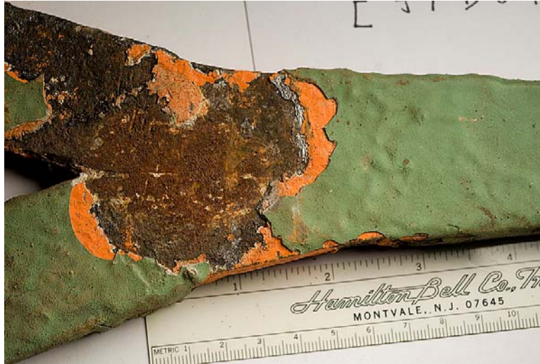
Figure 18. Crack Extends Short Distance on Bar 4. Extension of forge line is generally covered by paint.