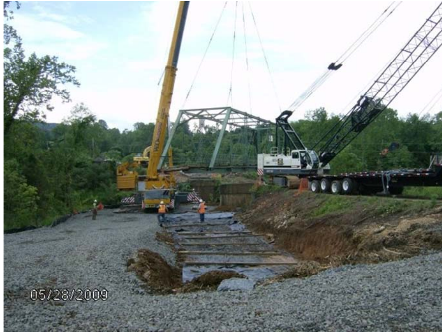
Figure 6. Lifting Entire Through Truss From Its Bearings