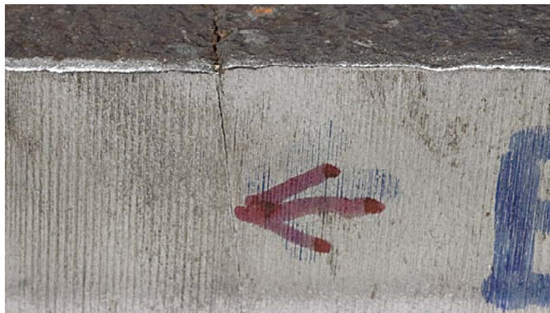
Figure 16. Close View of Crack at Forge Line