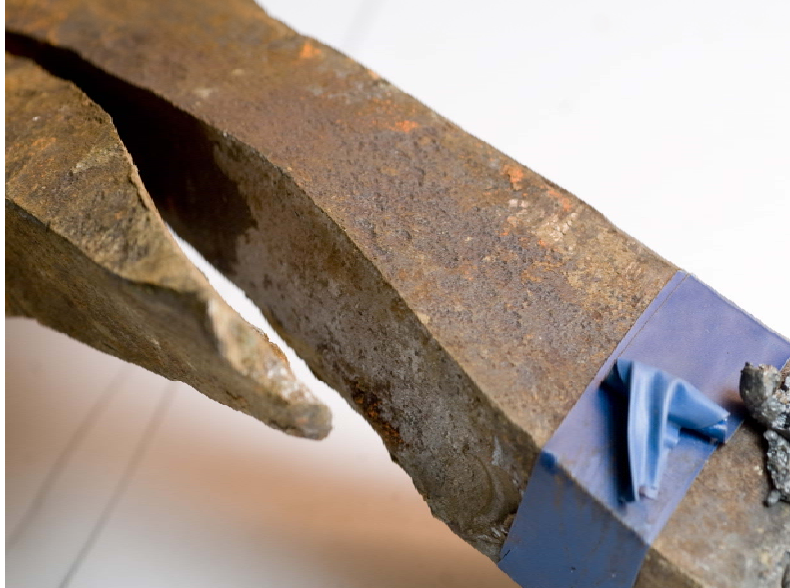
Figure 17. Fractured Forge Line of Bar Broken by Grading Equipment. Rust in upper portion indicates preexisting crack.

The warnings, cited earlier, that steel welds are not reliable indicates that care must be taken into account in making welded repairs on steel eyebars produced in the late 19th and early 20th centuries.