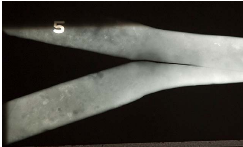
Figure 22. Radiograph of Bar 5 Showing Partial Length Crack. Forge line is faintly visible beyond crack.

It should be pointed out that these stresses do not represent the allowable working strength of the steel itself but instead the ultimate load of the eyebar itself when the entire forge line had fractured. Data indicating the ultimate tensile and yield strengths of the steel are shown in Appendix E. The single tension test of an eyebar sample performed by the VDOT Materials Division Laboratory in accordance with ASTM Standard A615 determined that the steel had an ultimate tensile strength of 60,253 psi and a yield strength of 38,000 psi. From the values in Appendix D, it appears that the condition of its loop-welded connection does limit the ultimate strength of an eyebar. It is worth noting that none of the cracked bars on the Advance Mills Bridge had been allowed to fracture completely at the forge lines. All were reinforced by cables to prevent the displacement that might accompany a total failure of the loop weld.