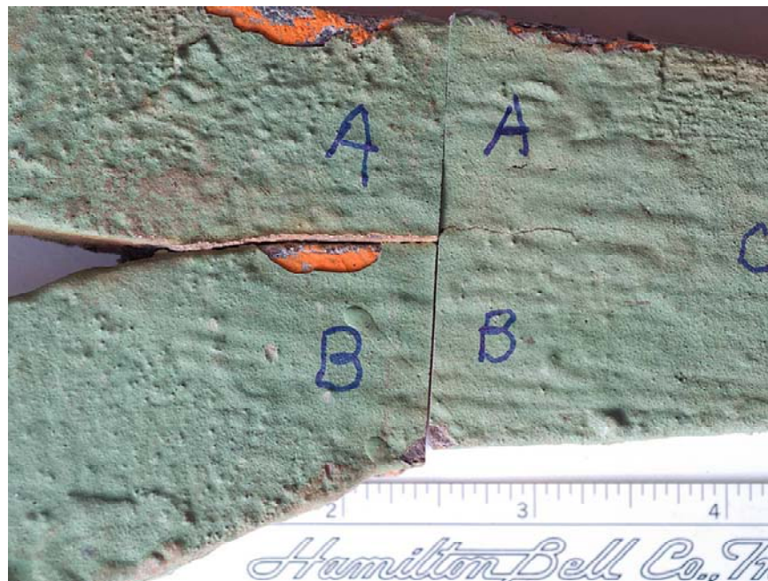
Figure 12. Eyebar Cut at End of Separation and Beyond End of Visible Hairline Crack

Figure 13 indicates the presence of the forge line running the full length of the specimen, and the radiograph in Figure 14 shows an apparent separation extending almost to the uncracked Face C, with the forge line visible to that face. Figure 15, Cross Section A-B, clearly indicates the presence of a tight but visible crack where it was indicated by the inspector. There was