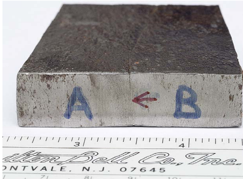
Figure 15. Face A-B Showing Tight Crack