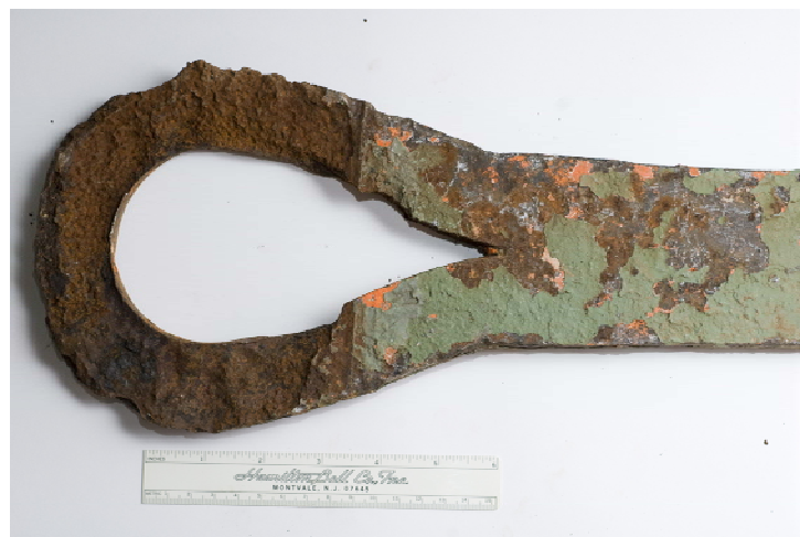
Figure 24. Extreme Section Loss in Lower Chord Eyebar

During the examination of the bridge it became evident that inspection and maintenance of those portions of the pinned connections that were under the deck, where the access to the bars at the panel points was obscured, were difficult. Examination of those members disclosed much more severe corrosion and section loss, such as shown in Figure 24, than that found on the outside members. Evaluation of these members during inspections requires special effort to ensure their adequacy, as they are hidden from view.