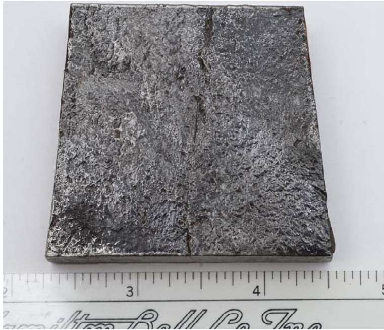
Figure 13. Forge Line Through Entire Length of Cleaned Specimen