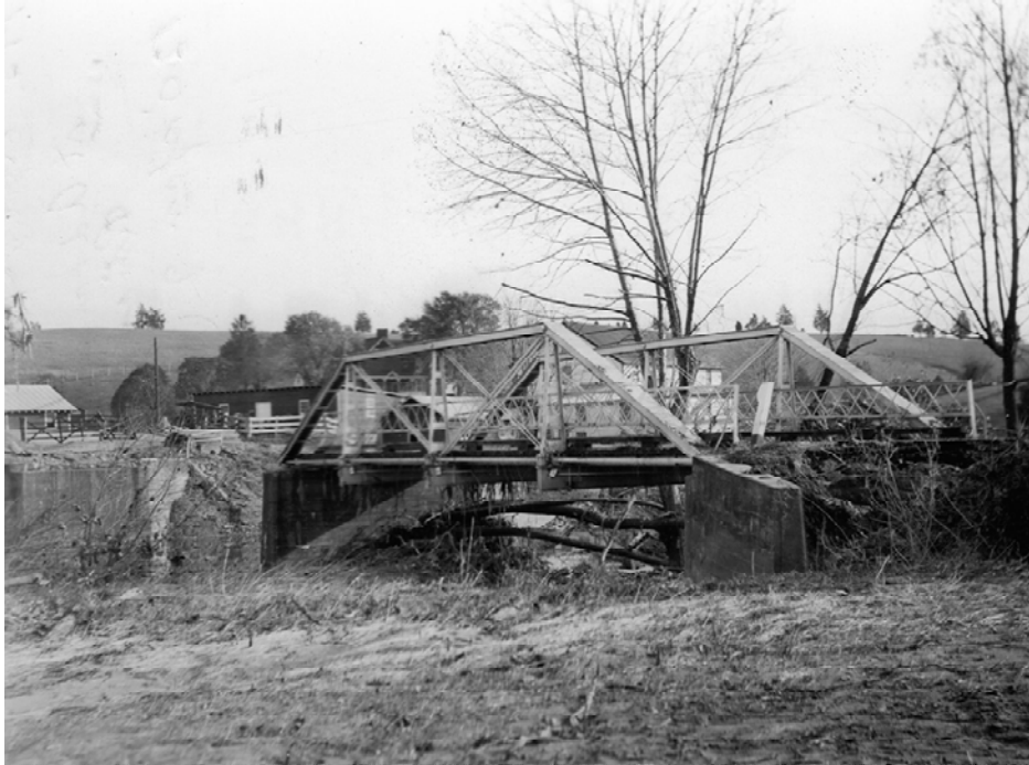
Figure 5. Advance Mills Bridge After Flood of October 1942

constructed at the east end of the 120-ft replacement span. (This approach span was replaced using galvanized beams in 2005.)