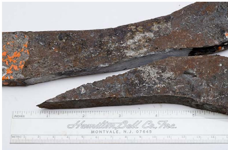
Figure 20. Forge Line of Bar 4 After Strength Testing. Small area of rust indicates previous crack along forge line.