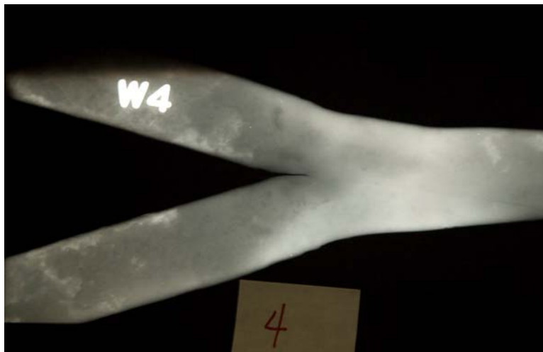
Figure 19. Radiograph Confirms Small Crack in Bar 4. Remainder of forge line is visible, but faint.