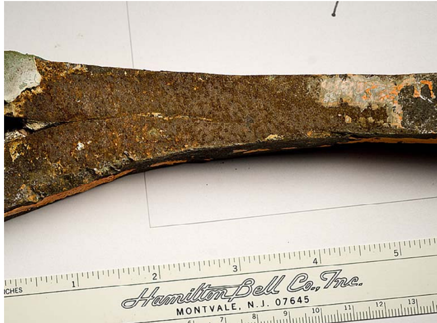
Figure 3. Hairline Crack Along Forge Line of Loop-Welded Eyebars

reliable.” Waddell (1889) provided an identical warning: “Loop-eyes shall be made of wrought iron, as steel cannot be relied upon to afford a proper weld.”