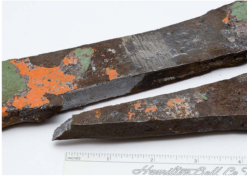
Figure 23. Forge Line of Bar 5 After Strength Testing. Rust indicates existing crack.

1949) based on structural carbon steel conforming to the requirements of ASTM A7-46 (withdrawn in 1967) to determine the area of hip verticals and hangers. VDH increased the allowable steel working stress by 1/9 from the specification value of 18,000 to 20,000 psi for die-forged or riveted members. In the case of loop-welded truss members, however, the working stress was reduced to 14,000 psi.