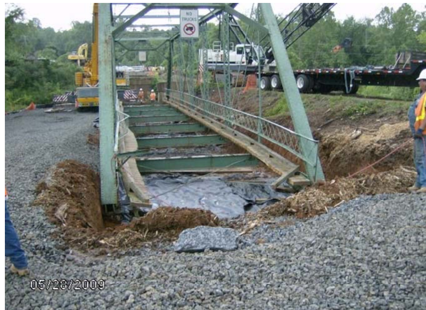
Figure 7. Through Truss Removed From Bridge, With Only Minor Distortion of Members