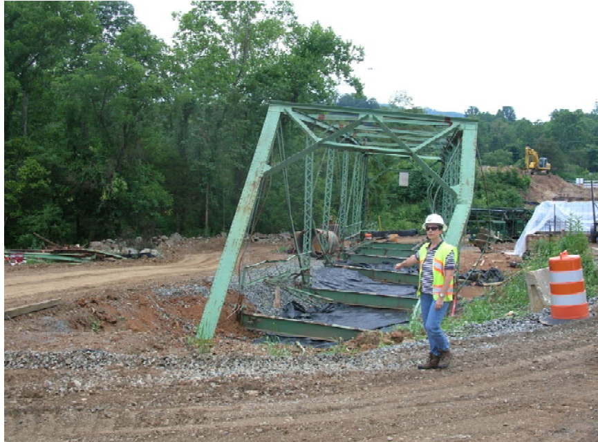
Figure 8. More Severe Distortion Resulting From Racking of Truss After Its Move to Facilitate Construction

several eyebars bent during the moving. Joints including eight selected members did remain intact and were marked for salvage.