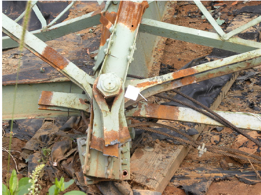
Figure 10. Panel Point With Member (silver tag) Selected for Study. Lead paint was mechanically removed from members prior to cutting.

Prior to pick up of the panel joints at the site, they were run over by a piece of grading equipment working on the approach roadway, further distorting many members and fracturing several at the forge lines (Figure 11). The effects of this series of incidents on the findings of this study, both good and bad, are noted in the "Discussion" section.