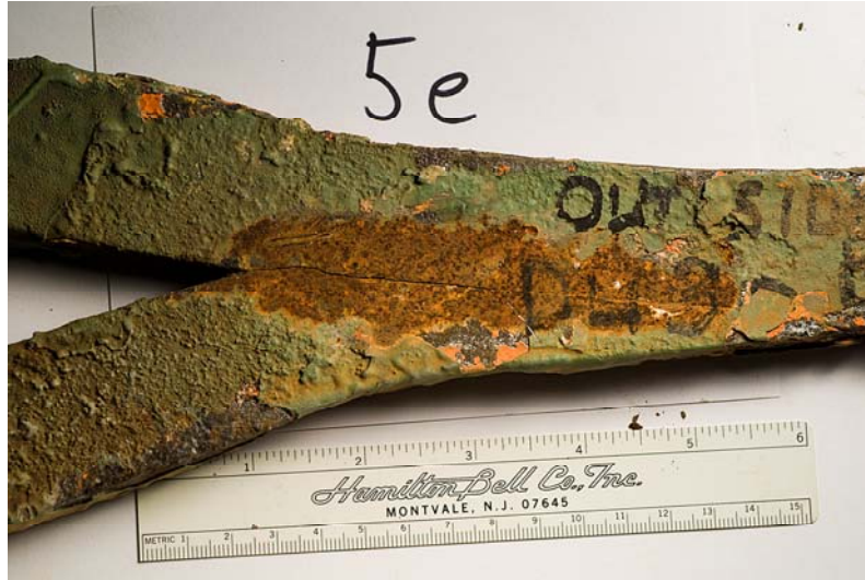
Figure 21. Bar 5 As Removed From Bridge. Visible crack extends along left side of forge line. Uncracked forge line is visible to right of crack.