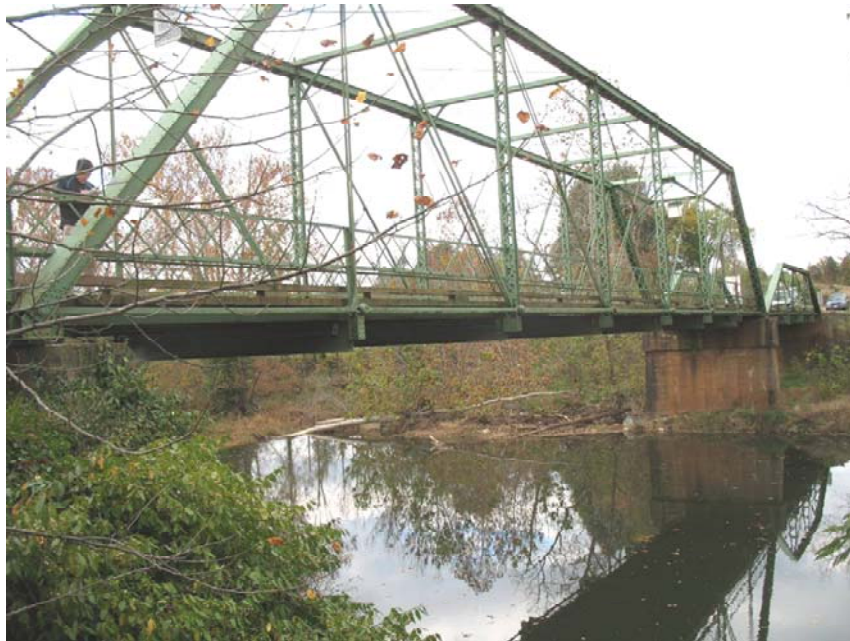
Figure 1. Advance Mills Bridge at Time of Final Inspection in 2007

The main span of the bridge was a steel through truss constructed in the Pratt configuration. This configuration, first patented in 1844, had diagonals in tension and verticals in compression (except for hip verticals adjacent to inclined end posts). The Pratt configuration is perhaps the most common configuration for truss bridges built in the United States during the later 19th and early 20th centuries. An overview of the Pratt truss configuration and loading was provided by McKeel et al. (2006).