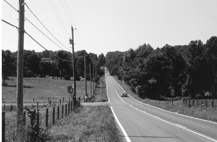
Figure E1. Present Route 231 north of Madison; this section was constructed in the 1930s. The abandoned trace of the Blue Ridge Turnpike is located in the woods to the right.

Well-defined road traces, apparently representing the original route of the turnpike, are visible on both sides of present day Route 231 just south of its crossing of Mulatto Run. The turnpike crossed Mulatto Run east of the present road and concrete bridge. The original turnpike bridge over Mulatto Run was a Queen post truss, similar to that over White Oak Run. A metal pony truss was erected at the old crossing in the 1910s; the road was realigned and the present concrete T-beam bridge built in 1932.