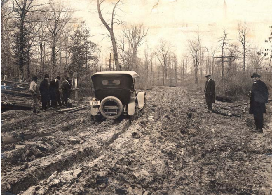
Figure C1. The “Tidewater Trail” (predecessor of Route 17), 1918.

Major reorganization of the highway department occurred during the late 1910s and 1920s. The designated state highway (primary) system came into being in 1918 to meet the requirements of the Federal Aid Road Act of 1916 in order for Virginia to be able to get federal funds. The creation of Virginia’s state highway system made more than 4,000 miles of significant roads in the state the direct responsibility of the highway commissioner and his staff. Modernizations and improvements were slowly effected on these roads. The way the Highway Commission was constituted was changed in 1919. It had been a technically oriented body, composed initially of the State Highway Commissioner and three civil engineers: the heads of the engineering departments of Virginia Military Institute, Virginia Polytechnic Institute, and the University of Virginia. In 1919 the commission shifted to a more political orientation. Its members had to be private citizens, representatives from the major geographical areas: Piedmont, Southside, Valley, Tidewater, and Southwest Virginia.