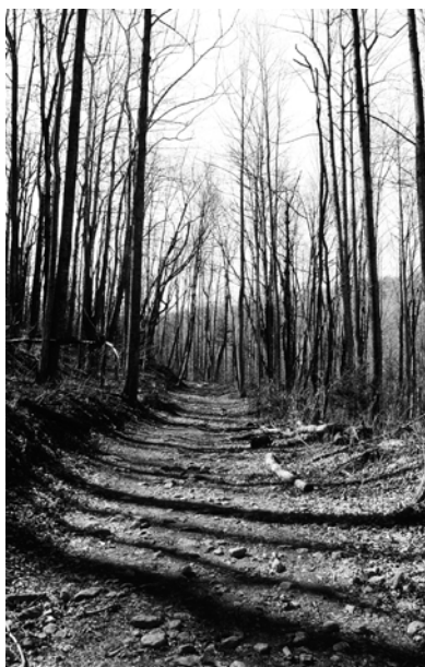
Figure E3. The route of the Blue Ridge Turnpike within the Shenandoah National Park.