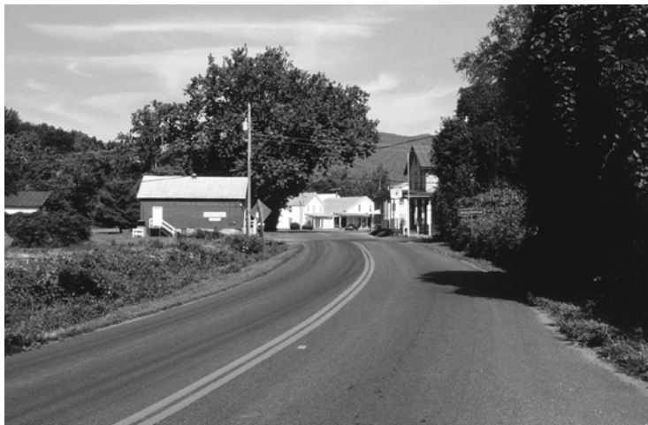
Figure E2. Present Route 670 passing through Criglersville.

The corridor of the old turnpike is represented between Banco, through Criglersville, and into Syria by present Route 670 (Figure E2). The route is a highly disturbed context because of the numerous flood episodes and the many subsequent road rebuildings during the late 19th and 20th centuries (Woodward and Gimbel, in-progress research).