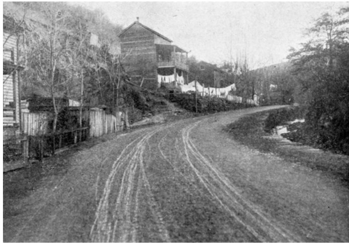
Figure C3. Road in Amherst County before (top) and after (bottom) state aid improvements, ca. 1907.