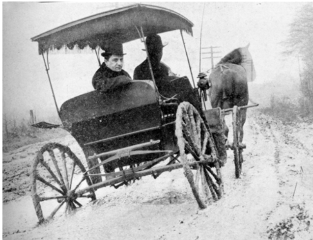
Figure C4. Road between Fredericksburg and Spotsylvania, before improvements, ca. 1910.