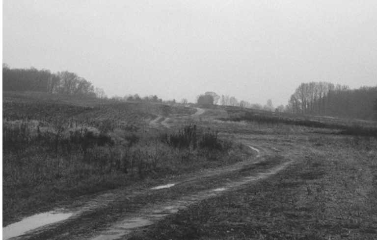
Figure E4. The Mud March Route Today

1863). Given the significance of the earlier Mud March attempted advance during the previous January, as well as the intact nature of the route north of the old Banks ford area, this route was also included as a case study for evaluation for individual eligibility. The Mud March route has both sufficient significance and integrity to justify individual eligibility for the National Register.