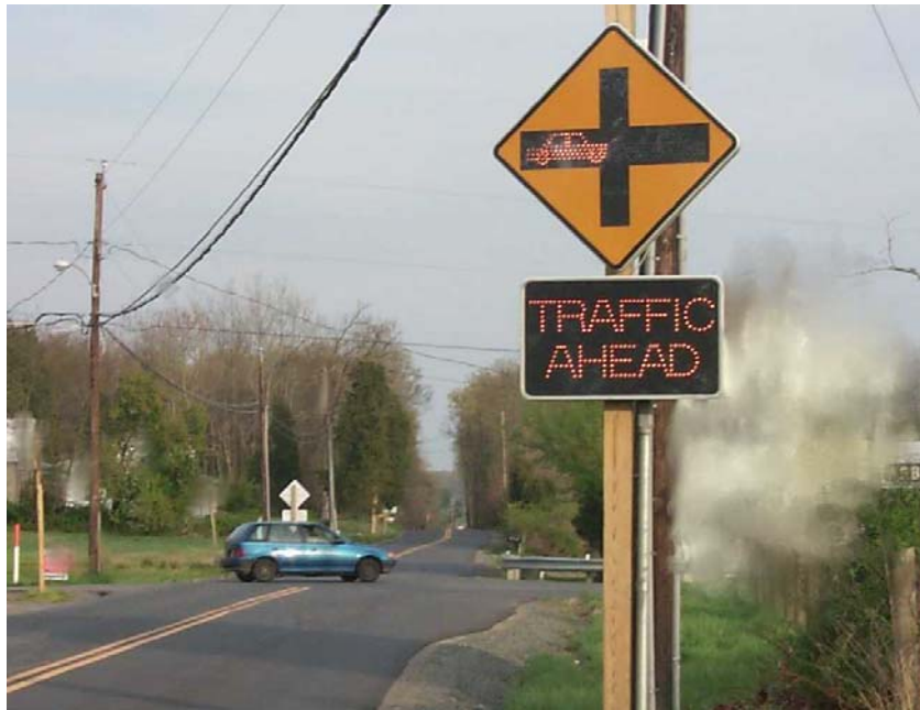
Figure 2. Major Leg CCS Sign (S2 in Figure 1).