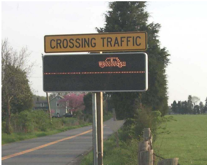
Figure 3. Minor Leg CCS Sign (S5 in Figure 1).