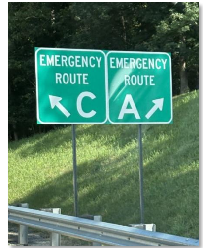
Emergency Routing Signs Installed on Interstate 64